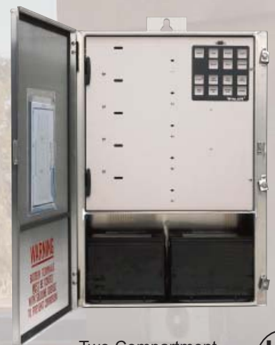
Two Compartment Electronics Cabinet

HSS Engineering Bredskiftevej 12 DK 8210 Aarhus V Phone + 45 70 22 88 44 Fax + 45 70 22 88 66 www.hss.dk email hss@hss.dk